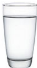
a glass of water