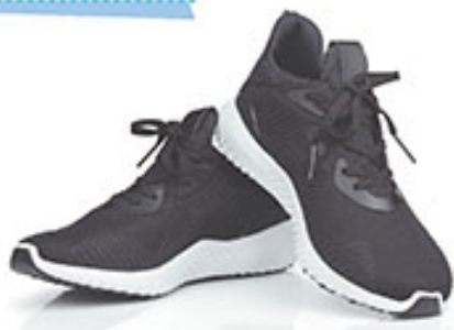
a pair of sneakers