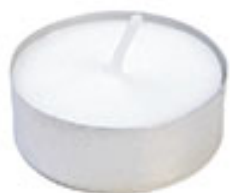
a white candle