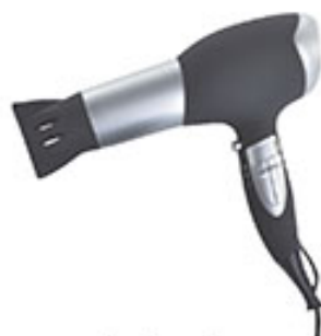
a hair dryer